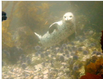
Dylan's Dive Buddy

The three-day trip to the Channel Islands aboard the Conception easily ranks among my top diving experiences. I cannot think of a better way to start a day than waking up to the smell of fresh coffee and a hot breakfast with all my gear set to dive.